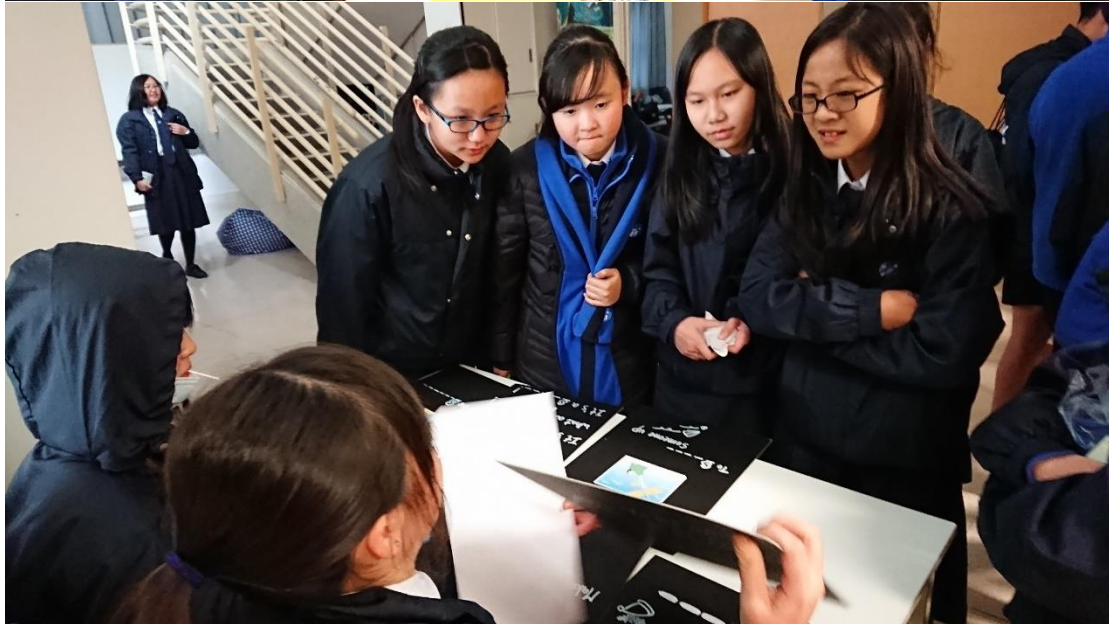
Chinglish slang terms